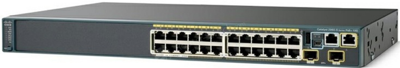
Table 1 shows the Quick Spec of the WS-C2960S-24PD-L.

Figure 1 shows the appearance of the WS-C2960S-24PD-L.