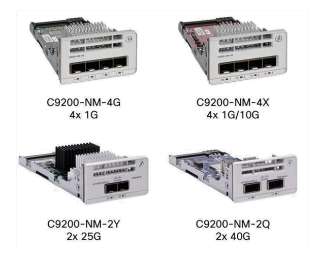
Figure 2. Cisco Catalyst 9200 Series Switch network modules

Cisco Catalyst 9200 Series switches come with modular or fixed uplinks as indicated in Table 1. With modular SKUs, the field-replaceable network modules provide infrastructure investment protection by allowing a nondisruptive migration from 1G to 10G and beyond. When you purchase the switch, you can choose from the network modules described in Table 3.