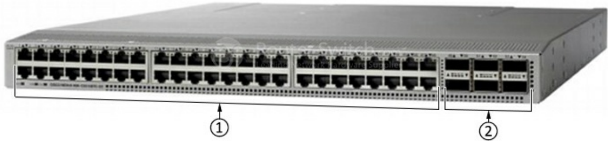
Figure 2 shows the front panel of N9K-C93108TC-EX.